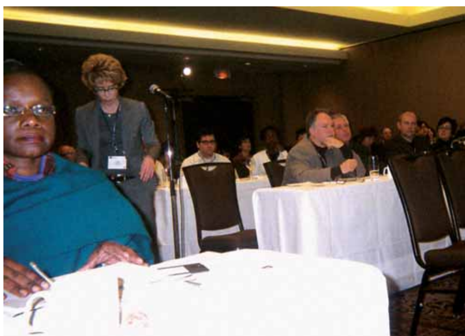
The 3 rd Annual GE 3 LS Symposium brought together experts to discuss genomics in agriculture, environment, fisheries and forestry.

Issues related to genomics research and applications in the fields of agriculture, environment, fisheries and forestry take centre stage.