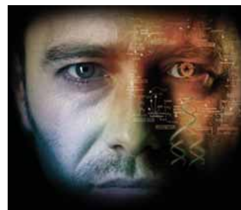
ReGenesis will air on Global TV this fall